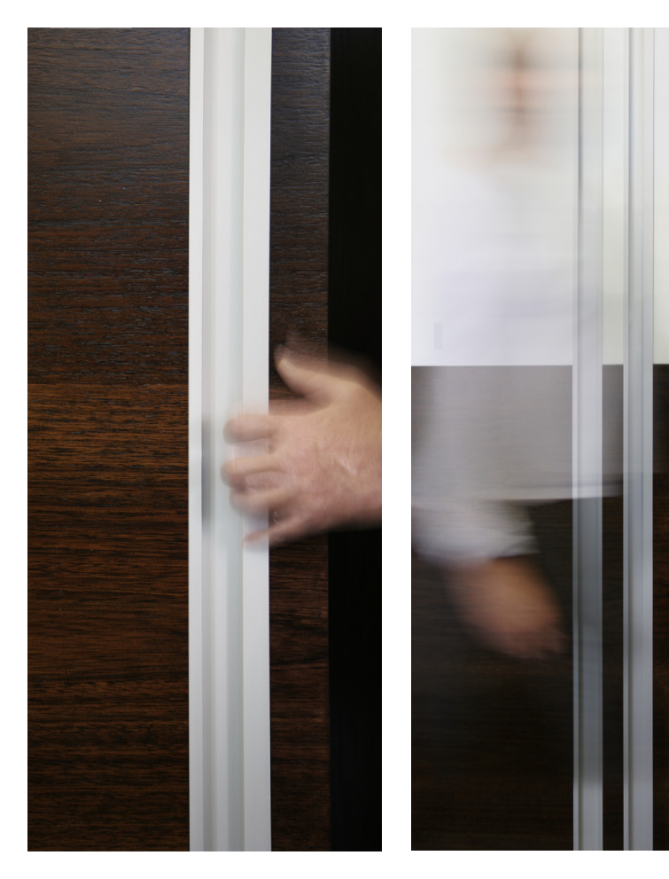
Radiused grip can be used left or right handed